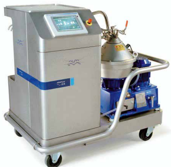
AlfaPure Z3 – a larger separation system from Alfa Laval.

Our total product range includes some 20 separators that also treat wash liquids, oils, other emulsions and paint waste. Alfa Laval is also the world's leading supplier of heat exchangers, helping customers around the world heat, cool and transport any type of fluid.